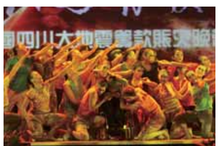
Nanyang Siang Pau and China Press co-organised the fund raising campaign to assist victims in the Sichuan Earthquake.