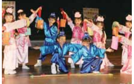
China Press co-organised the Mid-Autumn Festival Gathering Nanyang Siang Pau co-organised the MCA Deputy Presidential 2008 at the Mines Wonderland. Residents of Balakong, Selangor enjoyed the festive celebration.