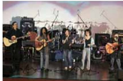
China Press co-organised a folk song concert in January 2008. The original singers of the Taiwanese folk songs were invited to perform in the concert and shared the memories of the past.