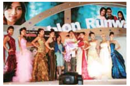
at Malacca. The 3-day event drew an overwhelming response from the public.